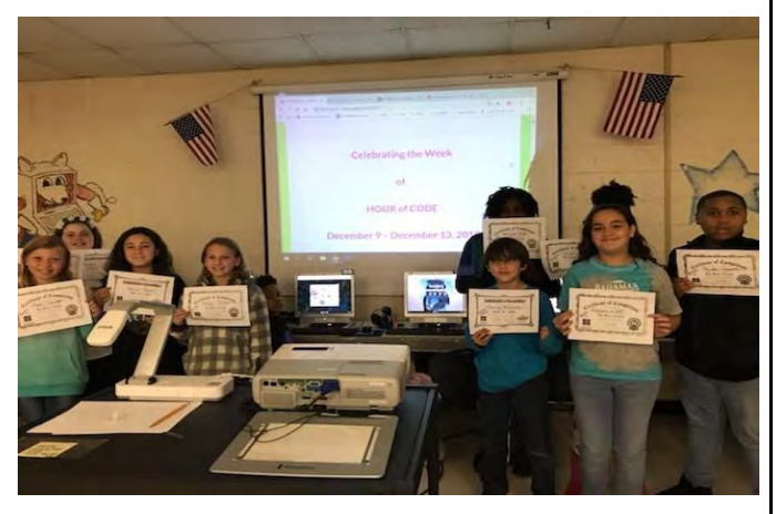
CELEBRATED HOUR OF CODE DURING COMPUTER LAB...