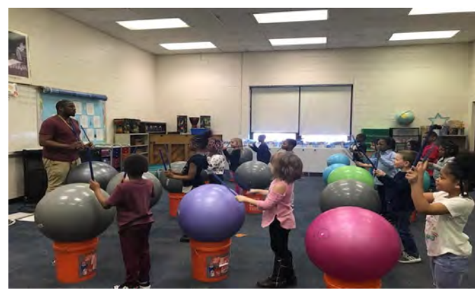
KINDERGARTEN IS PRACTICING THEIR BEATS DURING MUSIC ...