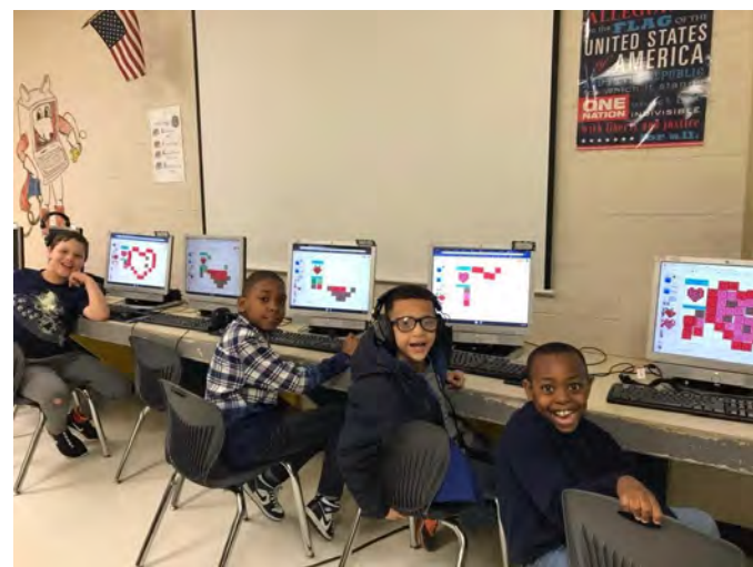
DIGITAL LEARNING DAY IS FUN WITH PIXEL ART IN THE COMPUTER LAB...