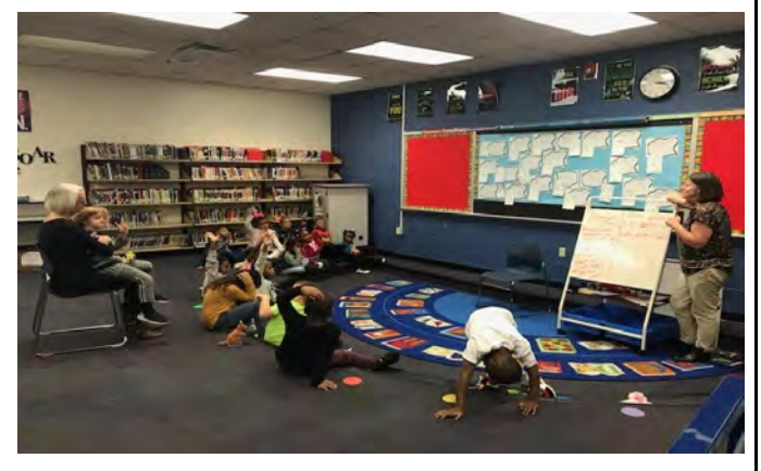
QUESTION & ANSWER TIME ON STORIES WE READ IN THE LIBRARY...