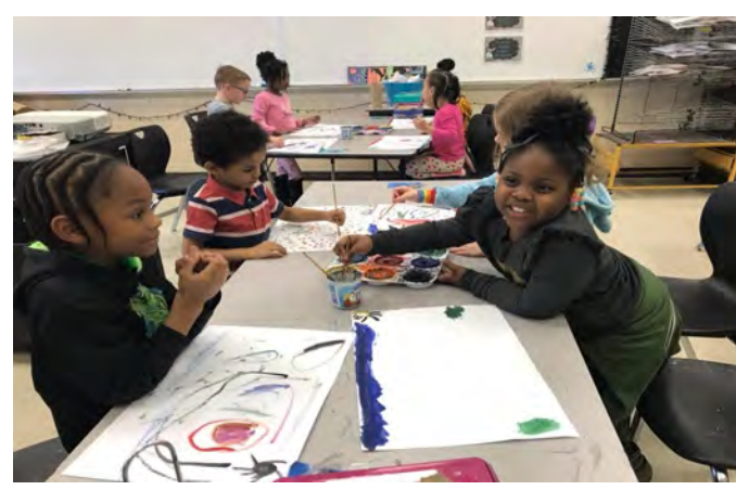
ALWAYS FUN IN THE ART ROOM...